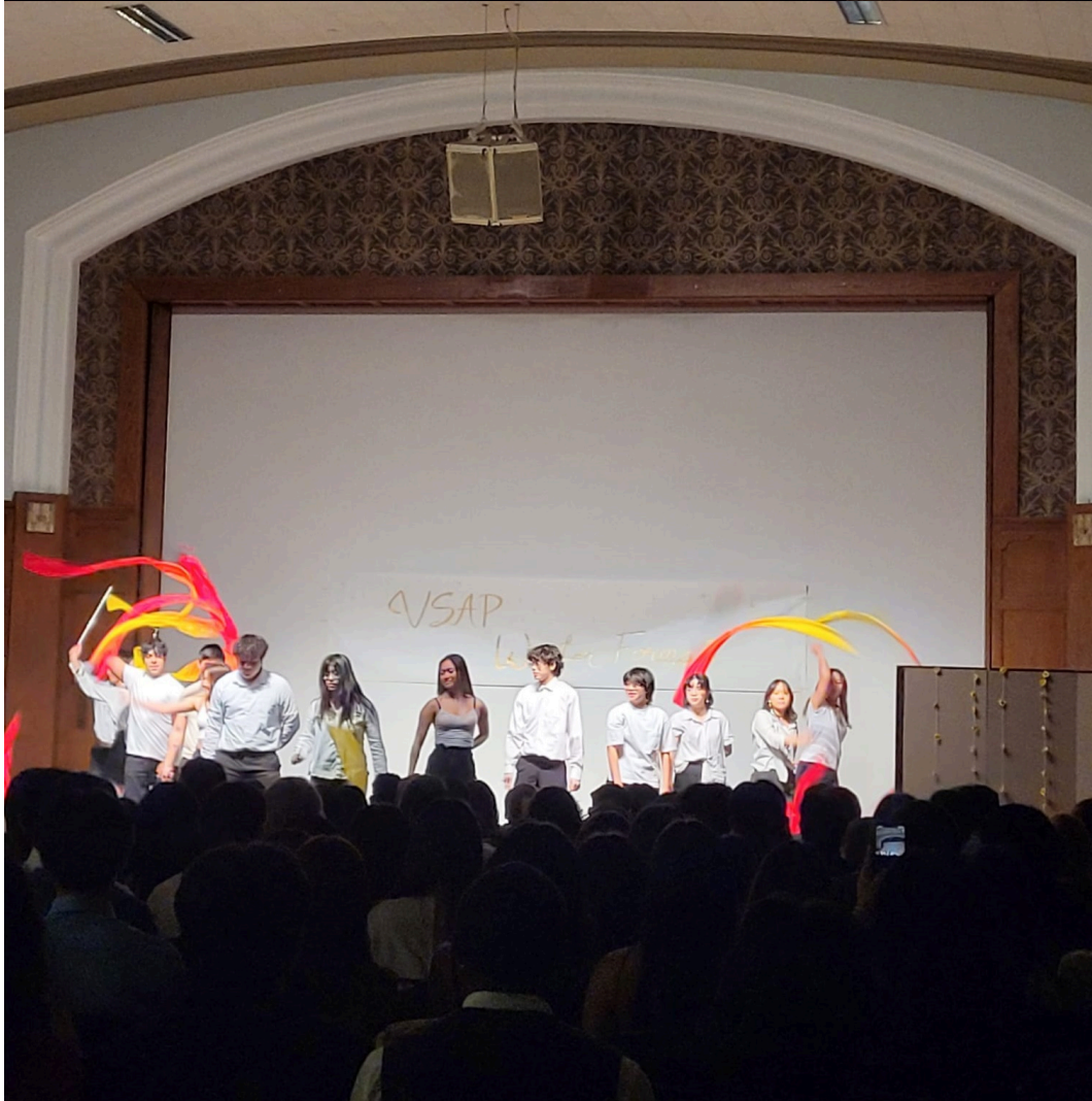
The AAARCC staff attended the Vietnamese Student Association's Winter Formal in support of the hard work and dedication the students put into the program.